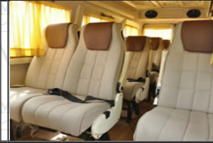
Tempo Traveller Seat