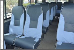
Tempo Traveller Seat

!!! Shree Kanaiya Travels Guarantee Hassle Free & Enjoyable Experience At All Times. !!!